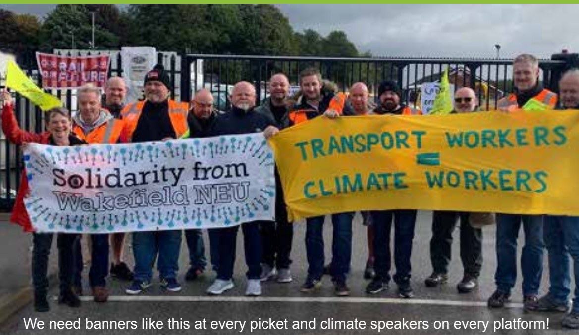
We need banners like this at every picket and climate speakers on every platform!