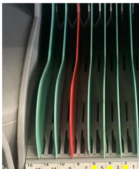
Route Name/Number :514 CRANLEIGH/514

Our Internal Audit team has highlighted that several units are not currently compliant , and this has also been highlighted through the Integrated Audit. To get us back on track, every unit must complete the actions below to verify their process, correct any gaps, and ensure full compliance going forward.