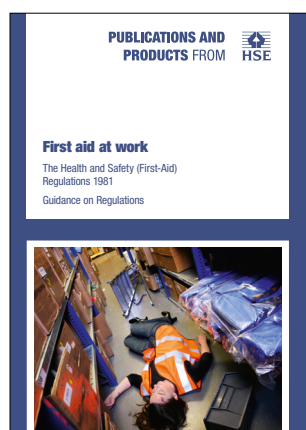
L74 (Third edition) Published 2013

This is a free-to-download, web-friendly version of L74 (Third edition, published 2013 – reissued with minor amendments in 2018 and 2024). This version has been adapted for online use from HSE's current printed version.